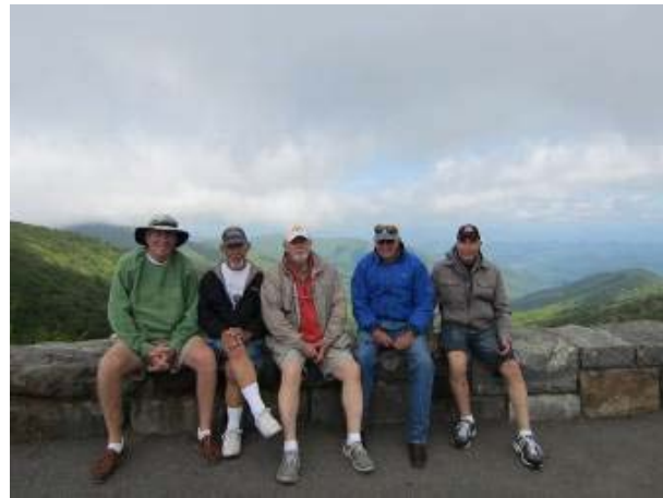
Day 4: Scenic overlook along the Blue Ridge Parkway