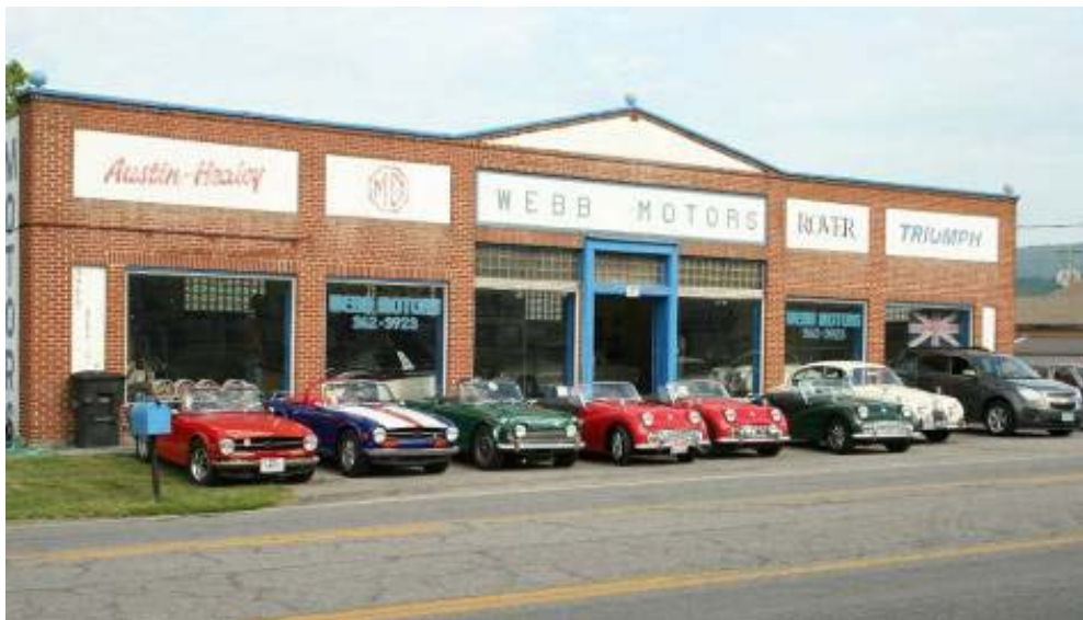
Day 5: Tour cars in front of Webb Motors in Roanoke, VA