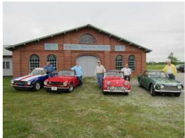
Day 13: a visit to The Roadster Factory in Armagh, PA