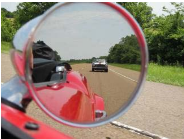
Day 15: Along one of the Kentucky parkways