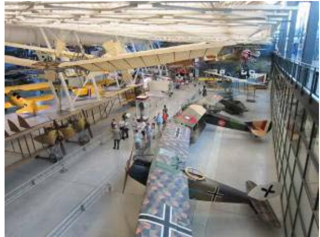
Day 6: Inside Air & Space Museum Annex