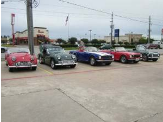
Day 1: in the beginning there were five Triumphs (Harris County Smokehouse)