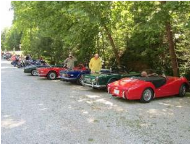
Day 3: Preparations for Tail of the Dragon