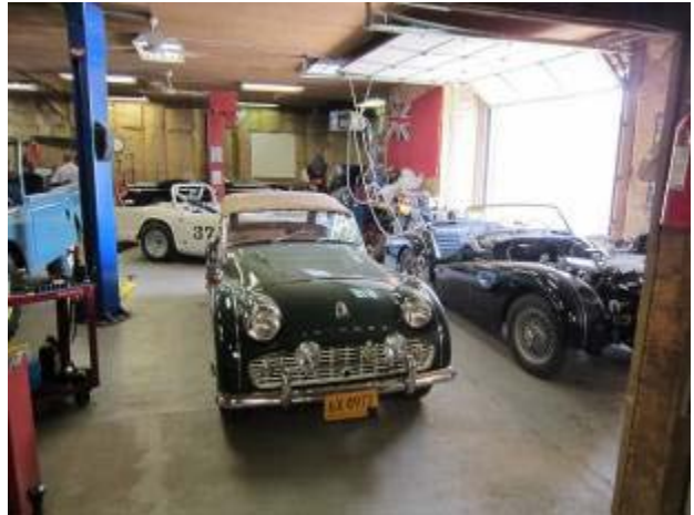
Day 7: visit to British Wiring / Triumph Rescue shop in Bally, PA