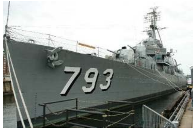
Day 10: USS Cassin Young (DD793) in Charlestown Navy Shipyard