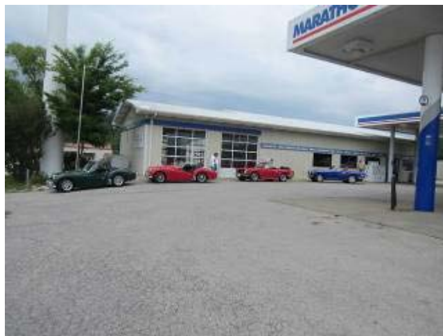
Day 15: Pit stop in Kentucky