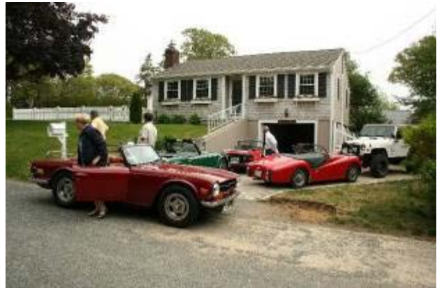
Day 9: Steve & Karen's Cape Cod cottage