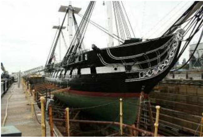
Day 10: USS Constitution in dry dock at the Charlestown Navy Yard in Boston, MA