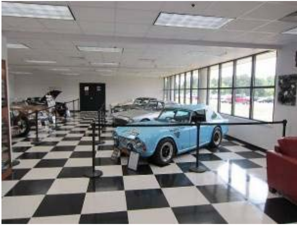
Day 5: inside Moss Motors showroom area