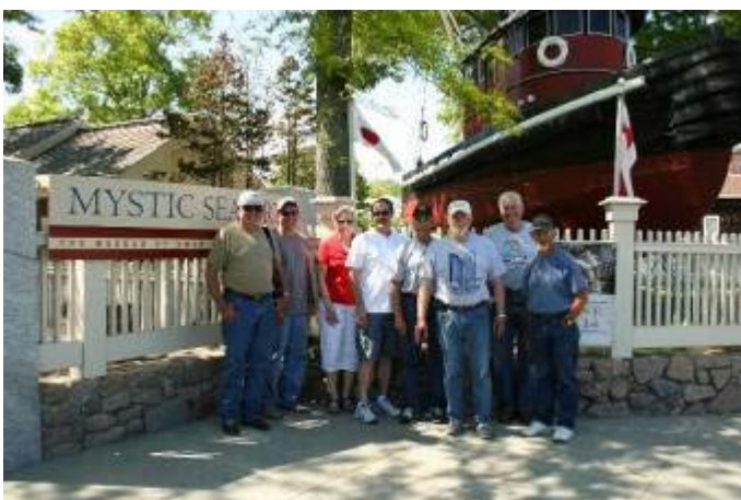
Day 8: visit to Mystic Seaport Museum in Mystic, CT