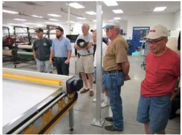
Day 5: Moss Motors upholstery shop