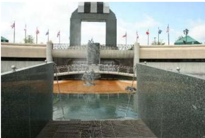
Day 5: National D-Day Memorial in Bedford, VA