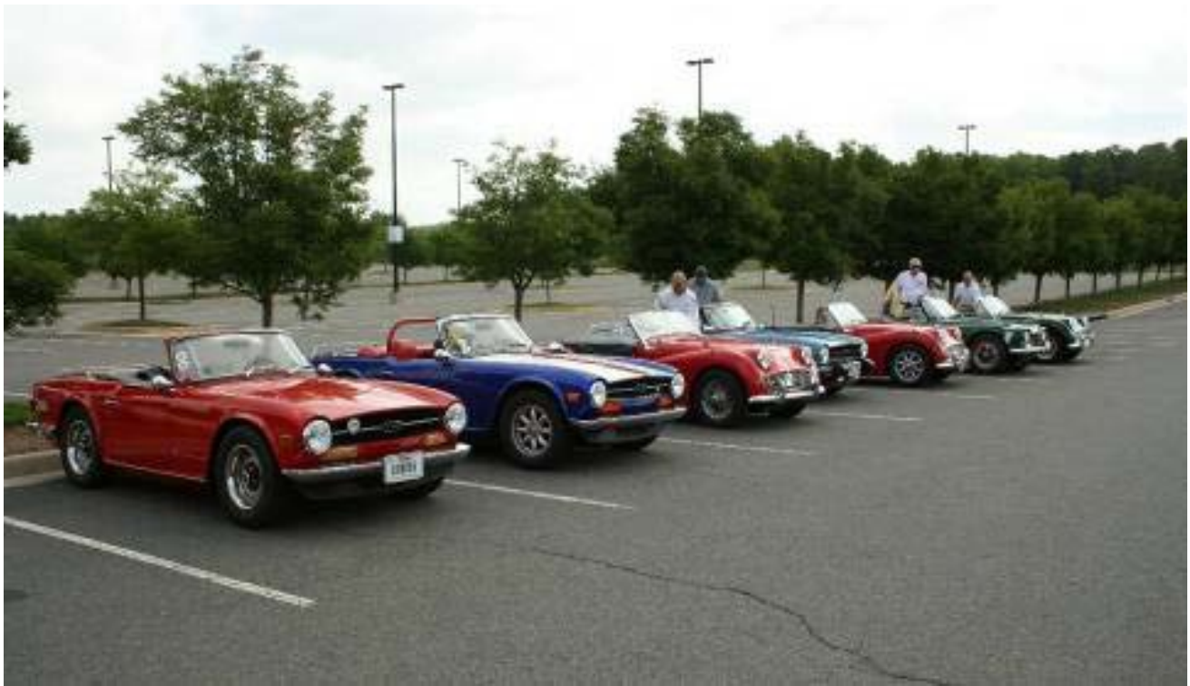
Day 6: visit to the Smithsonian Air & Space Museum Annex in Chantilly, VA