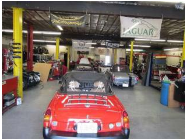
Day 7: visit to K & T Vintage Sports Cars facility in Allentown, PA