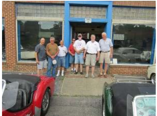
Day 5: Webb Motors, Brit cars since 1956