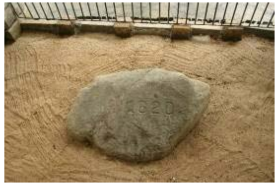
Day 10: a visit to Plymouth Rock in Plymouth, MA