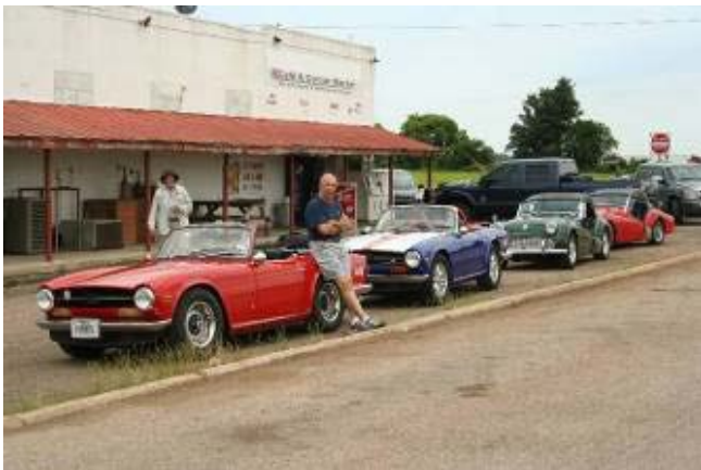
Day 16: Rendezvous location with Russ west of West Memphis, AR