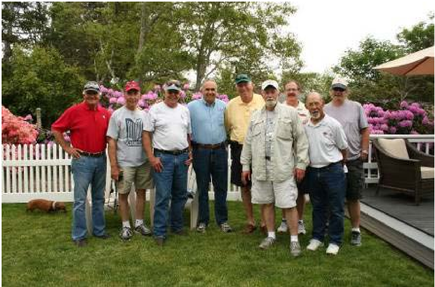
Day 9: Cookout at the Kirsis's