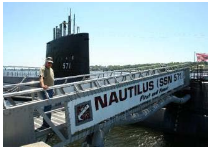
Day 8: visit to the USS Nautilus (SSN 571)