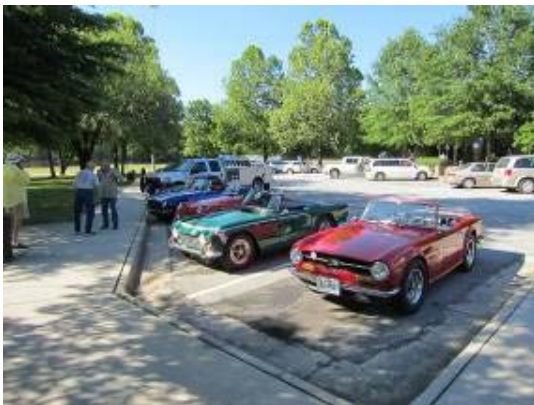
Day 2: the calm before the storm with Doug's TR6 fuel pump problem (rest stop along the route to Stone Mountain, GA)