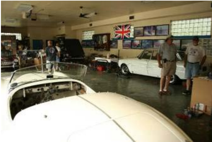
Day 5: inside Webb Motor