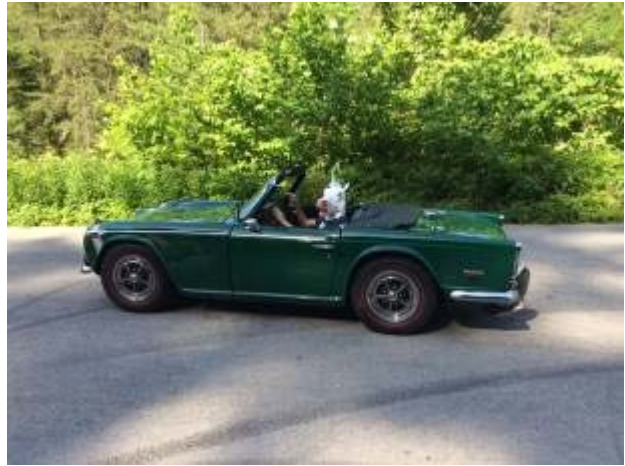
Day 3: First run along the Tail of the Dragon