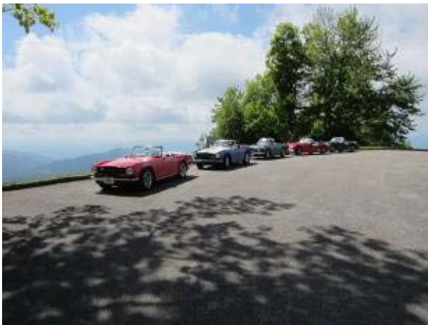
Day 4: Along the Blue Ridge Parkway