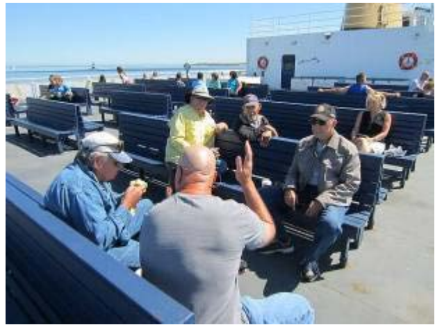
Day 8: Onboard the Cross Sound Ferry to New London, CT