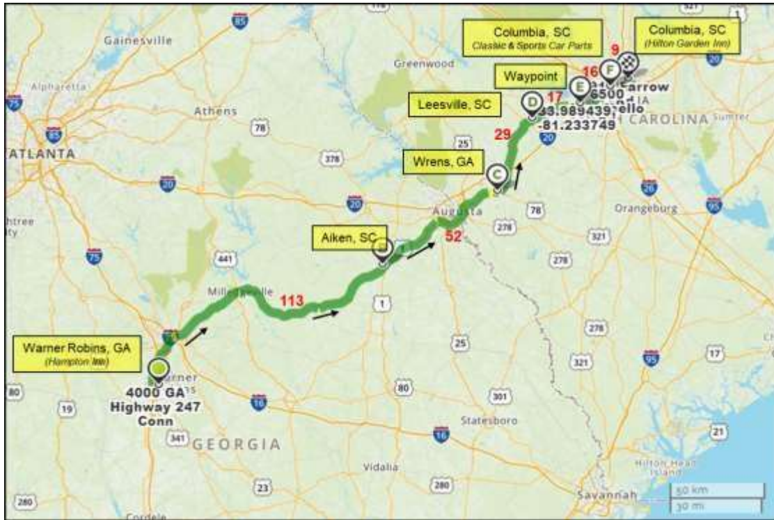
Overview map of Day 4 drive from Warner Robins, GA to Columbia, SC