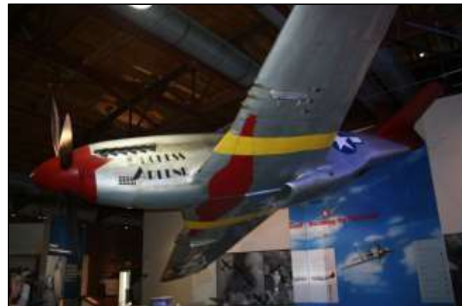
P-51 Mustang, one of the "Red Tails"