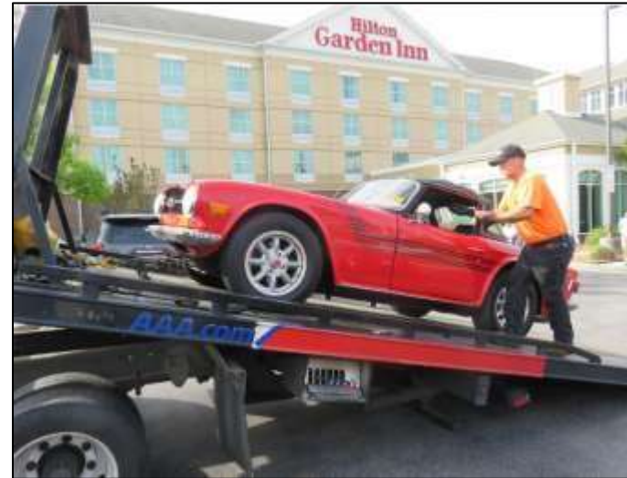
Meanwhile in the front parking lot, preparations are underway for towing Fred's TR6 to Charleston.