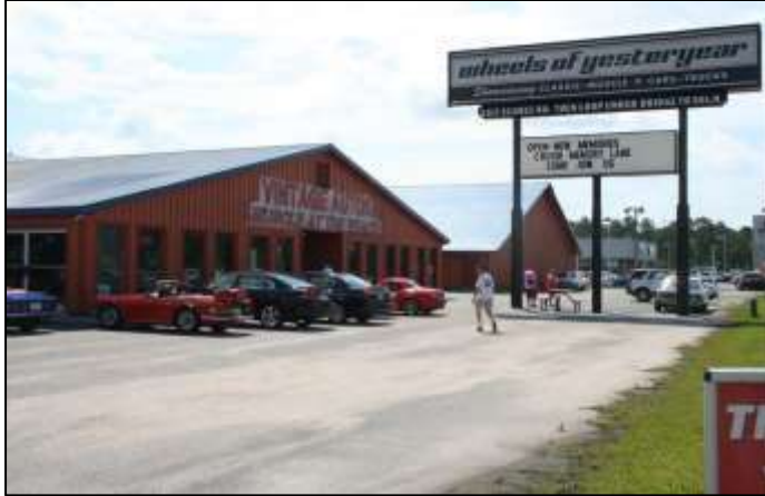
Wheels of Yesteryear car museum in Myrtle Beach, SC