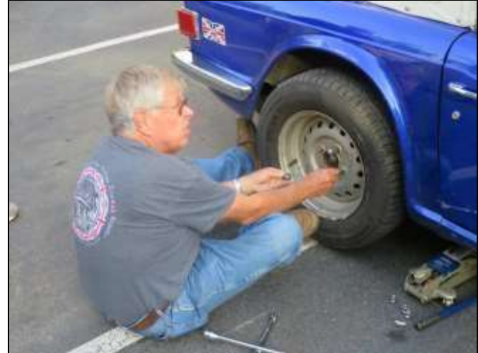
Spare installed, but not for long!