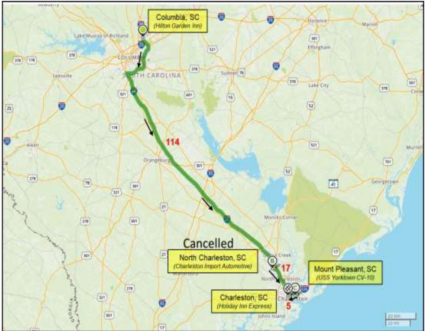
Overview map of Day 5 drive from Columbia, SC to Charleston, SC