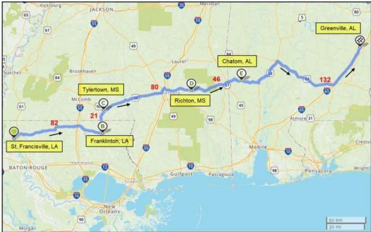
Overview map of Day 2 drive from St. Francisville, LA to Greenville, AL