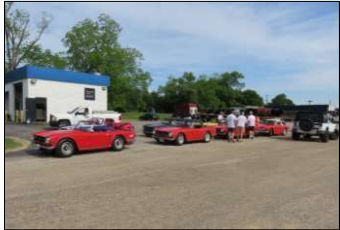
Locals stop by for a visit during gas stop.