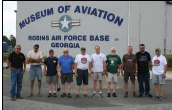
Triumph pilots at Museum of Aviation.