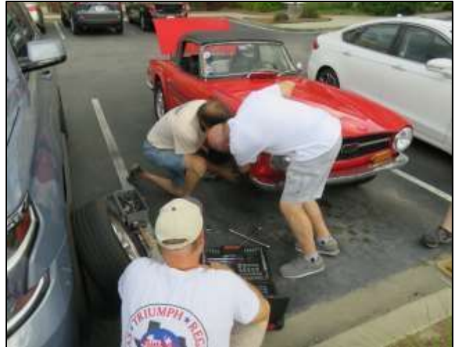
"Houston we have a problem"!