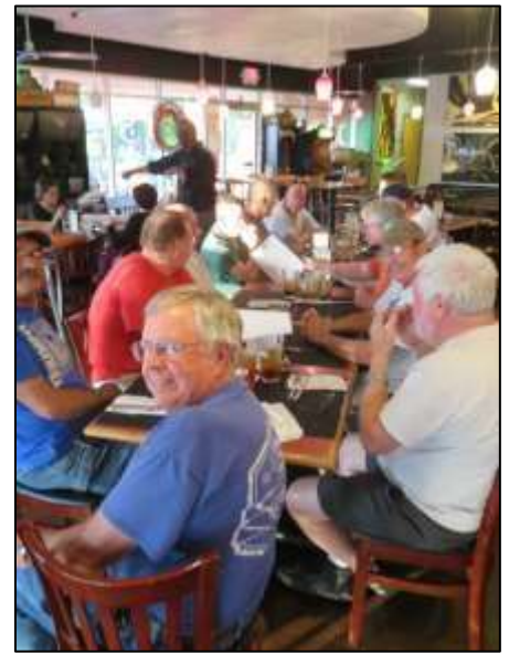
A nice Italian dinner

The second part to this article will summarize Days 8 thru 15 and cover the drives from Durham, NC to Norfolk, VA, Annapolis, MD, Lynchburg, VA, Asheville, NC, Chattanooga, TN, Oxford, MS, Alexandria, LA and our return to Houston. During this period, five more "Screaming Chicken Awards" will be awarded and the overall tour award winner determined! Several very interesting car related venues, a historic site and drives along some fantastic top-down driving roads are covered in the second part of the story.