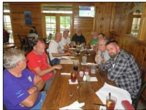
Evening dinner at The Francisville