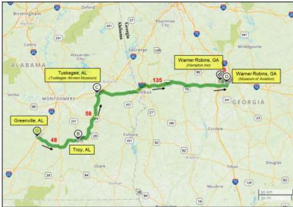
Overview map of Day 3 drive from Greenville, AL to Warner Robins, GA