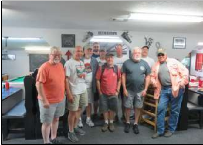
Lunch at Big Daddy's Rockin Café , Richton, MS.