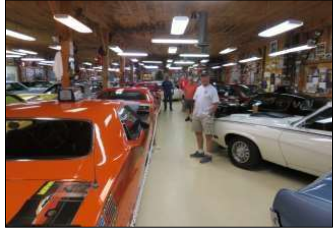
Nice collection of muscle cars!