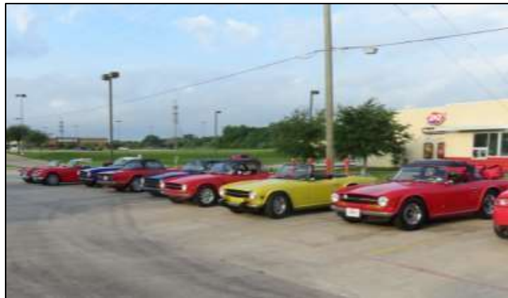
The grid of Triumphs at meetup venue in Tomball, TX