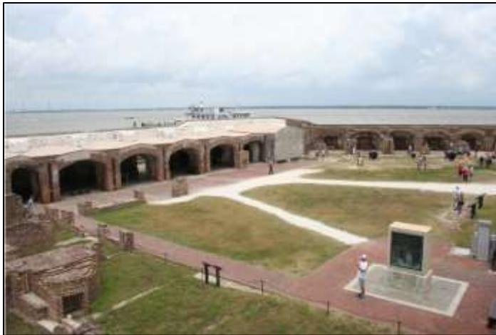
View looking down on a portion of Ft Sumter.

Day 6 was an open day in Charleston, where the group could visit the tourist sites in the Charleston area. Several of us headed for a ferry boat ride out to Ft. Sumter, where the first shots of the American Civil War were fired. It was a very interesting historic site and the hour spent walking around the old fort was quite enjoyable. Several others of the group walked around the historic district of downtown Charleston and later reported that it was very interesting to see the numerous restored historic buildings. For the group I was with, after our return from Ft. Sumter, we travelled back to the hotel and jumped in our Triumphs and headed for the Hunley Museum which was about a fifteen-minute drive from the hotel. The Hunley was a Confederate submarine that was the first submarine to actually sink a ship (USS Housatonic a Union Navy sloop, sunk on February 17, 1864). The second successful submarine was not until WW I. The museum was very informative and well organized. The submarine was discovered outside Charleston harbor back in the mid-1990s and subsequently raised in 2000. After the tour of the museum, we followed Mike Hado to visit one of his old Merchant Marine Academy shipmates, who is the current owner of Mike's very first Triumph a 1966 TR4A. It was a very nice visit followed by dinner at a nearby popular restaurant.