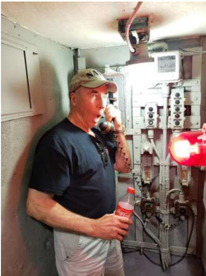
Patriots Point, Vietnam Experience exhibit.