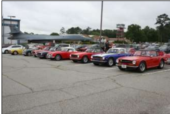
Triumphs at Museum of Aviation with B-1 bomber.