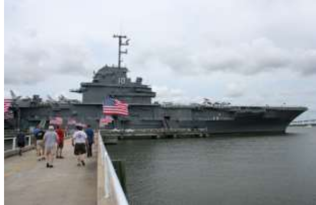
Patriots Point, USS Yorktown CV-10