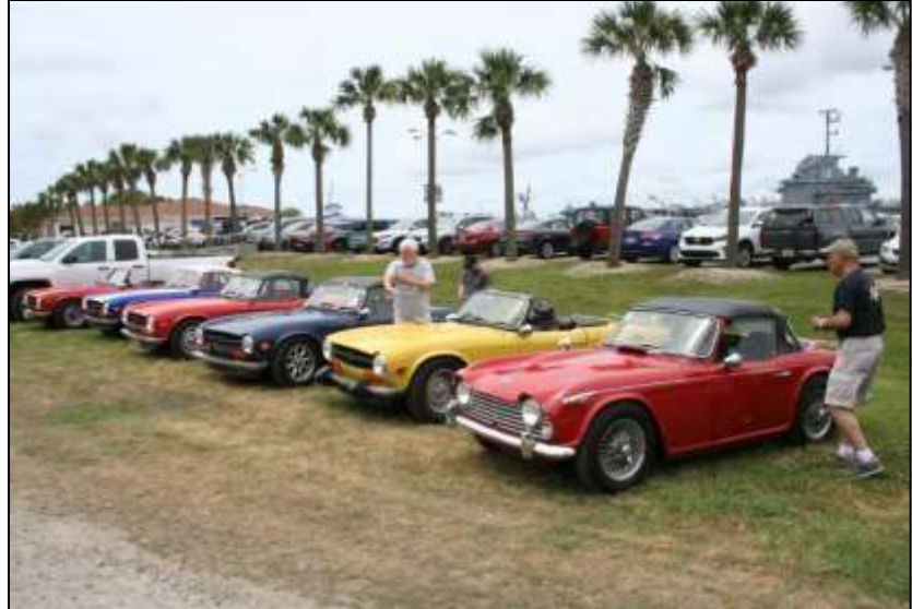
Triumphs with USS Yorktown CV-10 in background.