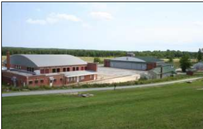
Hangars and facilities at Tuskegee Airman Historic Site.