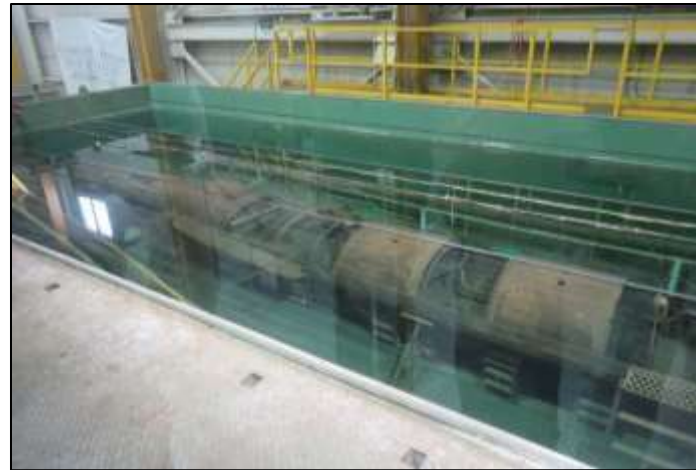
H.L. Hunley in preservation tank.