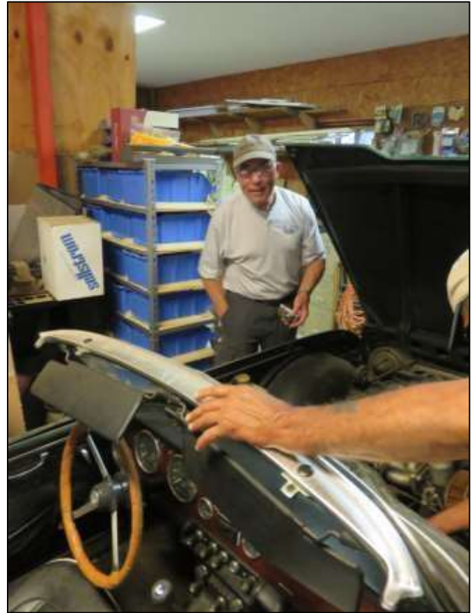
Could be another project!