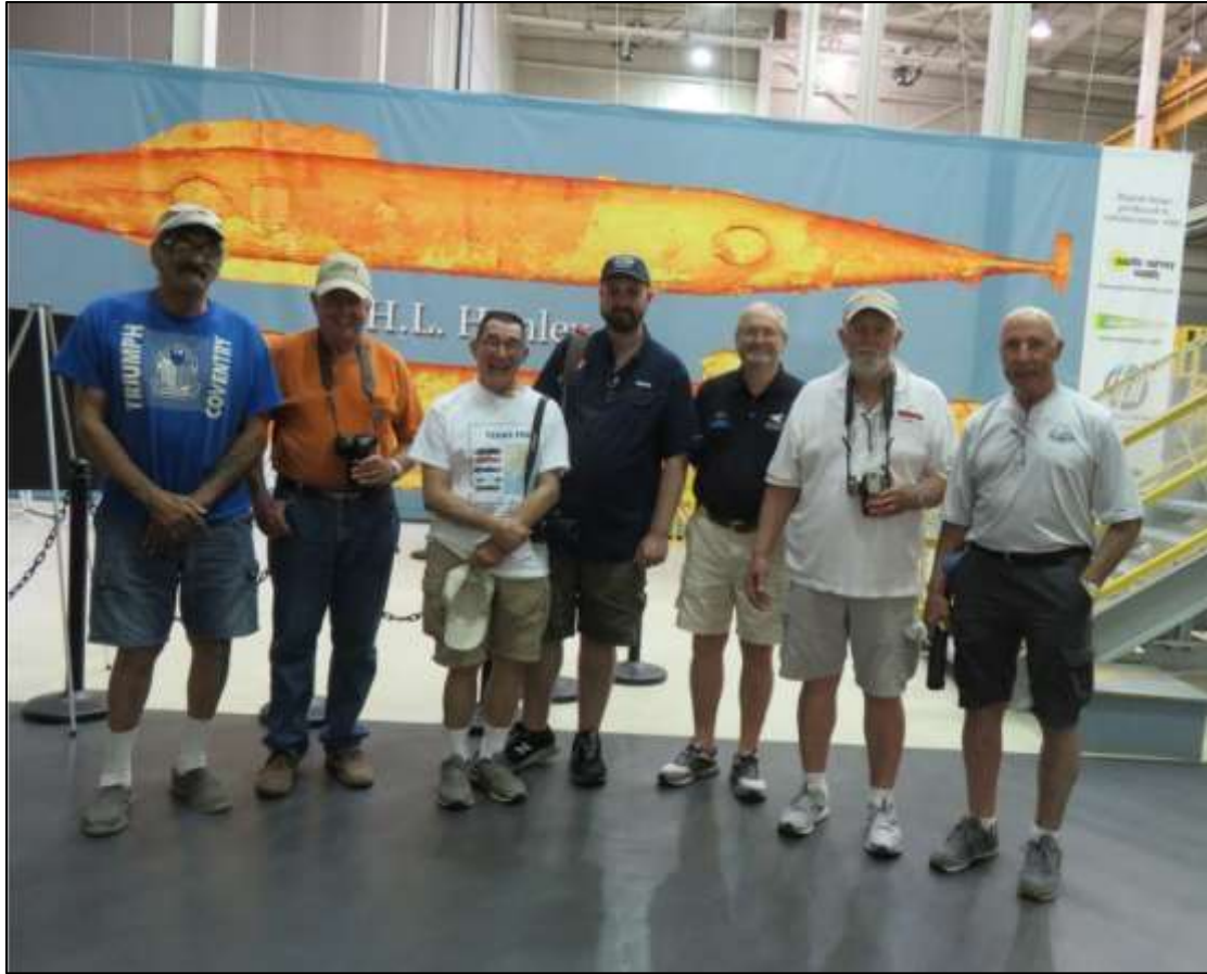
Tour group that visited the H.L. Hunley Museum with tour guide.