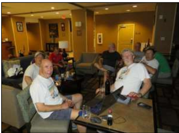
Day 1 wine hour at hotel.