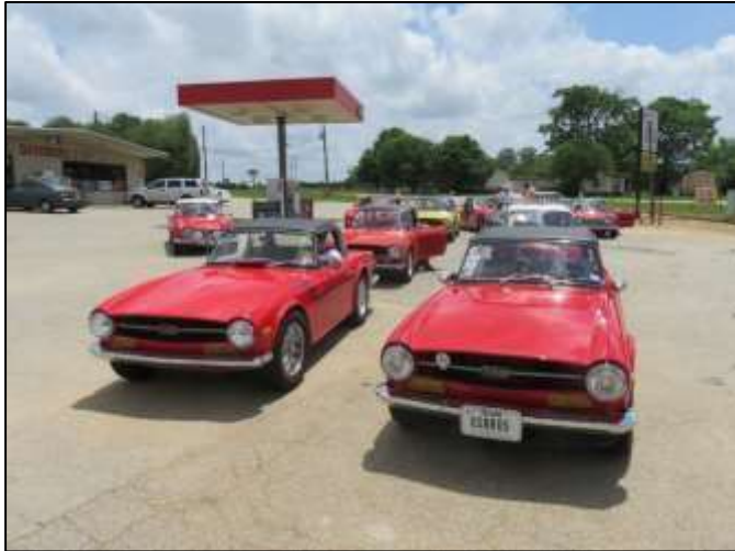
Look closely for the non-red Triumphs!