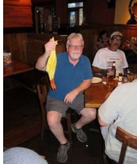
Evening wine and award presentation.