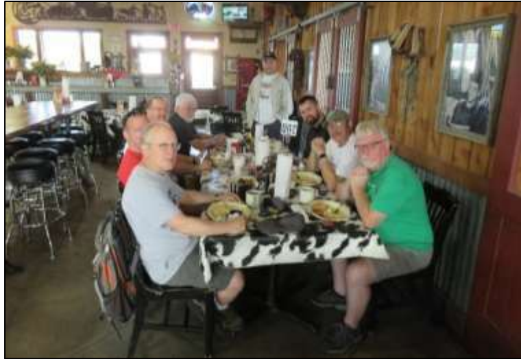
Departure breakfast at Harris County Smokehouse , Tomball, TX