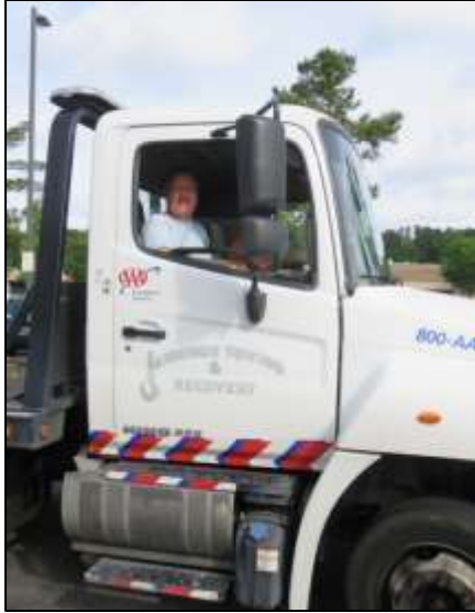
Winner 2019 "First-To-Breakdown Award"